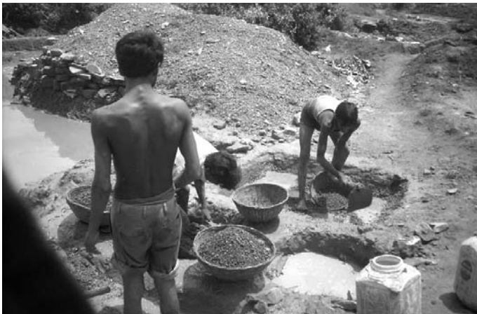
Young boys digging for diamonds (Photo August 2009)

A teenage boy interviewed, stated that he has been working in the mines from the age of 10 and he now gets a daily wage of Rs.70. The stone quarry near Gandhigram village provided evidence of child and adolescent labour. The boys, who were around 17 years of age, explained that they work under a contractor who pays them Rs.35–40 for one piece of stone broken. The boys earn, on an average, Rs.70–100 per day and the material, to their understanding, is sent to the states of Uttar Pradesh, Bihar and Rajasthan and to the city of Bhopal in Madhya Pradesh. They reported that working hours vary from contractor to contractor, but on an average, each boy works for 10 hours daily. All the boys interviewed belonged to the Gond tribe and they have been working for a few years now.