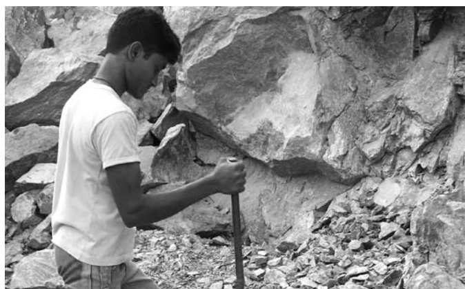
Teenager working in the quarry for the last few years

Minor minerals have a major role in the mining activities in Andhra Pradesh. The state has both major minerals like coal, bauxite, limestone and manganese. Particularly coal and bauxite