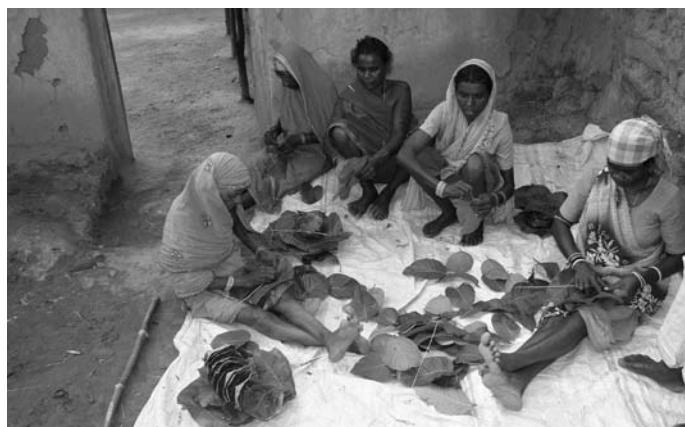
Local livelihoods destroyed due to mining activities (Photo November 2009)

Another serious issue, as stated by an activist from the Raigarh-based Jan Chetana People's Movement 196 , is that mining companies are simply acquiring rich agricultural land on which farmers are dependent for their sustenance, even if they do not do mining. This is the case of Jindal Steel and Power Plant, which got the lease in June 2006 but has not undertaken any mining activities till date. Technically, the lease should be cancelled as per the rules of the Ministry of Environment and Forests, but the Jindals continues to hold control over the land because of its sheer muscle power over the state machinery.