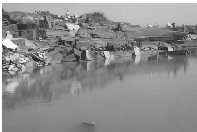
Stone quarries and diamond mines exist together in Panna (Photo August 2009)

Madhya Pradesh is the sole producer of diamonds and slate in India. The state is also the leading producer of copper concentrate, pyrophyllite and diaspore. In 2007-08, the value of mineral production in the state was Rs. 80.62 billion, an increase of 17 per cent from the previous year. 145 Madhya Pradesh accounted for 7.4 per cent of the total mineral production in the country, making it the sixth largest mineral producer in India. There were 319 reporting mines in the state in 2007-08. In terms of general trends, the production of coal and manganese ore in the state has increased over the years, but the production of bauxite and copper ore has decreased.