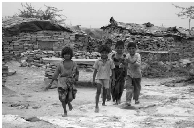
Children of stone quarry workers in Bhat Basti, Jodhpur (Photo July 2009)

Across all three districts, parents recognised the importance of quality education for their children and highlighted this as a major concern in the mining areas. However, in all the communities the same crucial issues around education were raised—the lack of basic facilities in schools, teacher absence, the lack of secondary schools in the area. Parents expressed frustration over the fact that their children have