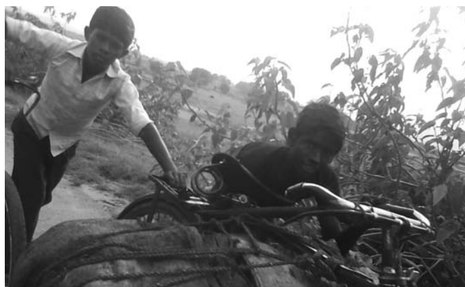
Boys walk with cycle loads of coal for 3–4 days at a stretch, to sell coal in the big towns Hazaribagh (Photo September 2009)

Jharkhand is a state predominantly having an adivasi population living in the midst of the curse of mineral