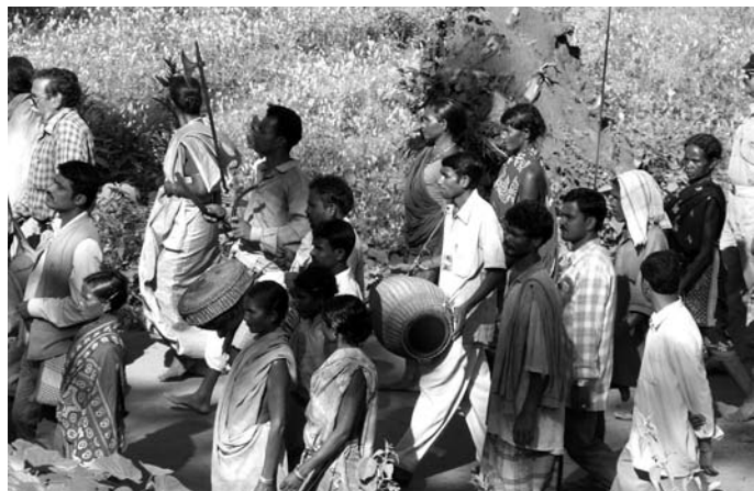
Struggle of people from Kasipur

More than 60 false criminal cases have been filed on the local leaders of the movement so far. People, however, organised rallies, public meetings and strikes to prevent the project from being implemented. On 16 December 2000, police entered the area and opened fire indiscriminately at the people and three adivasis were killed with many seriously injured. Since then, the situation in Kasipur is tense, with clashes between adivasis who are opposing the project and those outside, who are instigated by corporate agents. The interference of police and sporadic clashes that occur every time increase pressure and harassment on people, and have threatened the security and peace in the area. It was with great difficulty that the case study was conducted as the study team, faced antagonism, suspicion and intimidation from the community who have had to deal with constant political and corporate manipulations. Table 2.24 gives some demographic details of the project area in Kasipur.