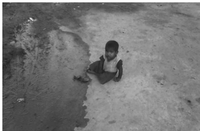
Malnourished child at Mudagaon village (Photo November 2009)

The health department personnel at the PHC admitted that there are far more number of patients approaching the centre now than before and this is because of the health problems being created by mining. The women stated that they prefer to have deliveries at home than at the PHC because of the condition of the roads and poor transport. Earlier there were incidents when women delivered on the way to the PHC due to the strenuous journey on these roads. The nurse also mentioned that three out of five women are suffering from anaemia. The health staff reported that fungal infections and hepatitis are on the rise mainly due to infections from polluted water