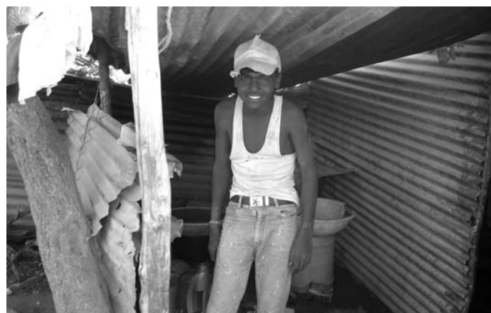
Child worker in stone quarry in Pune (Photo September 2009)