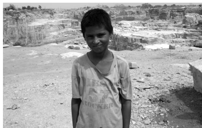
Child engaged in stone quarry at Kaliberi (Photo July 2009)

Thousands of children in the state are out of school and working in the mines and quarries. With the informal nature of the sector, and the vast number of mine and quarry sites across the state, it is difficult to accurately estimate the number of children involved. However, in just one mine in Kaliberi, Jodhpur district, mine workers reported that there were more than 100 children—over 50 of whom are girls—working in the mine and that children tend to start work there when they reach 12 years of age. 113 Children are employed to fill tractors with stones and earn around Rs. 80 for every tractor filled. Children under 12 years of age are