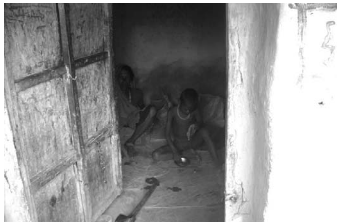
Adivasi child from displaced family, axe at his side, has a frugal meal before leaving for the mines (Photo August 2009)

no work in the village, many of the younger people were migrating to other areas. In addition, with the introduction of NREGA there has been an increase in corruption that has destroyed the peace in the village. The people seconded his comments adding that they do not get even 10–20 days of work in a year, so it really does not provide them any guaranteed employment. Moreover, the Thakurs and Yadavs dominate the villagers and grab whatever schemes reach their village, whether it is BPL cards or NREGA job cards. Wages according to the NREGA is currently Rs.85 per person day.