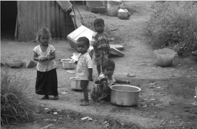
Basic housing and sanitation are absent in stone quarry workers' colonies—children consuming polluted water (Photo September 2009)

most of the sites the women complained that they often fell sick on consuming the water.