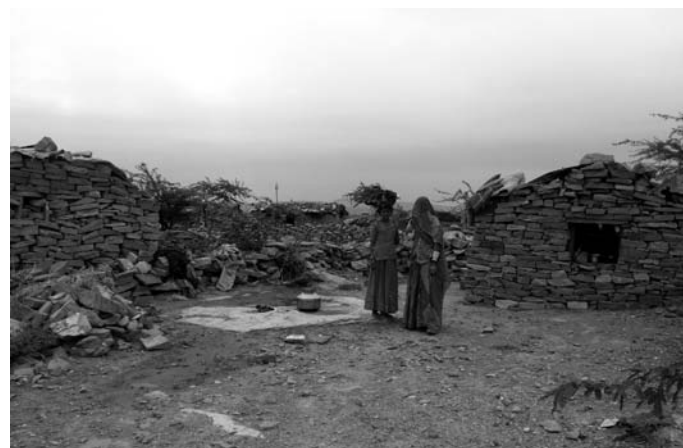
Women and young girls walk long distances for mine work and for water (Photo July 2009)

The research team visited three districts in Rajasthan in July 2009—Jodhpur, Jaisalmer and Barmer. Visits were made to mine sites and quarries, villages engaged in mining, villages located close to mine sites, anganwadi centres and PHCs.