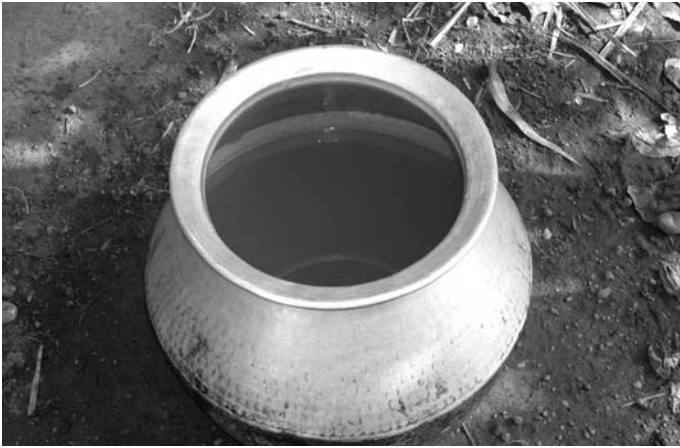
Contaminated drinking water in mine workers' colonies, Sundergarh (Photo November 2009)

the company and the mine tailings were dumped into the river converting into a highly polluted water body unfit for consumption. It was evident that the water in the entire region is contaminated and consists of heavy metals and dust, as a result of overdrawing of water and dumping of mine waste. The sponge iron factories have dug up bore-wells creating serious groundwater depletion. The 49 sponge iron factories with each having 15–20 deep bore-wells having a depth of about 800 ft from the ground level is more than a cause for alarm for the people of this region.