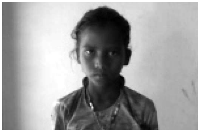
A mine worker's child who dropped out of school to support her family (Photo July 2009)

A brief survey on the quarry workers' children was undertaken in three mandals of Chittoor district in Andhra Pradesh, by Mitra Association for Social Services (MASS), which is based in Palamaner. Palamaner mandal is situated on the borders of the states of Tamil Nadu and Karnataka and consists of 16 panchayats and 96 habitations. Bairedipalli mandal is situated in the borders of Karnataka state which consists of 24 panchayats and 102 habitations. Peddapanjani mandal is situated in the border of Karnataka state and consists of 22 panchayats and 302 habitations. This area was selected because of the presence of clusters of traditional stone-breaking communities and because of the work of MASS with these communities.