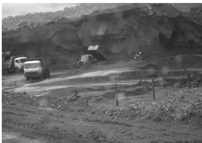
Iron ore being loaded in Joda-Barbil area, Keonjhar (Photo July 2009)

Early marriage continues to be a problem in the state. In Orissa, almost 30 per cent of girls get married before 18 years of age and there is a high degree of inter-state variation. In the backward districts, such as Koraput, Kalahandi and Balangir, more than 50 per cent of girls are married before the age of 18. 250 However, in the coastal districts, such as Puri and Jajpur, less than 15 per cent of girls are married before the age of 18.