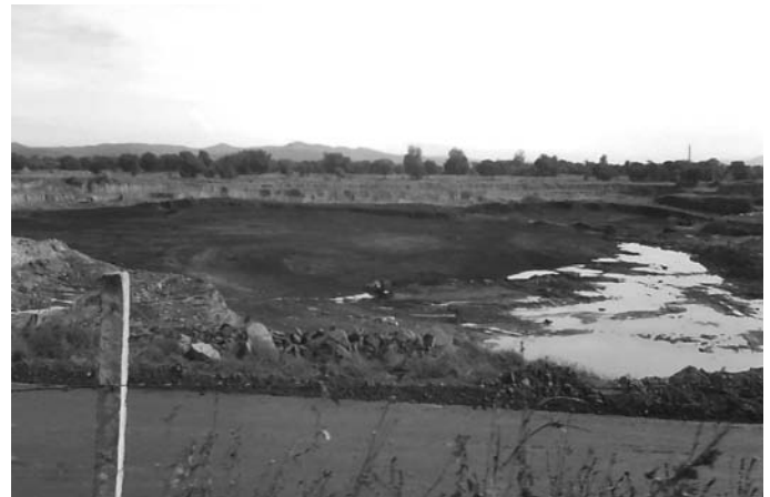
Coal filled agricultural land in Tamnar block (Photo November 2009)

At the time of this study (16 November 2009), a major agitation was taking place against the proposed Jindal Power Plant in Gare village. On 5 January 2008, a public hearing was held amidst strong people's protests as the affected communities were opposed to the project and they had no prior project related information. In spite of this, the district authorities conducted the public hearing by bringing in people