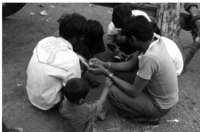
A group of youth gambling in front of the anganwadi with children as audience, at Rajapura in Sandur (Photo December 2009)

was extremely poor and looked as if cooking a meal here would lead to food poisoning or ill-health of the children. The anganwadi has a toilet that cannot be used. The sewage water drains in front of the school serving as a breeding ground for mosquitoes. Some youth were found to be gambling with the money they just earned from the mining trucks, right outside the anganwadi with the anganwadi children peering over them with curiosity. The children reported that the only frequent visitor to the anganwadi is a snake that comes through the crack in the walls. The whole atmosphere reflected how the life of the children in the mining area was insecure and unhealthy, both physically and socially.