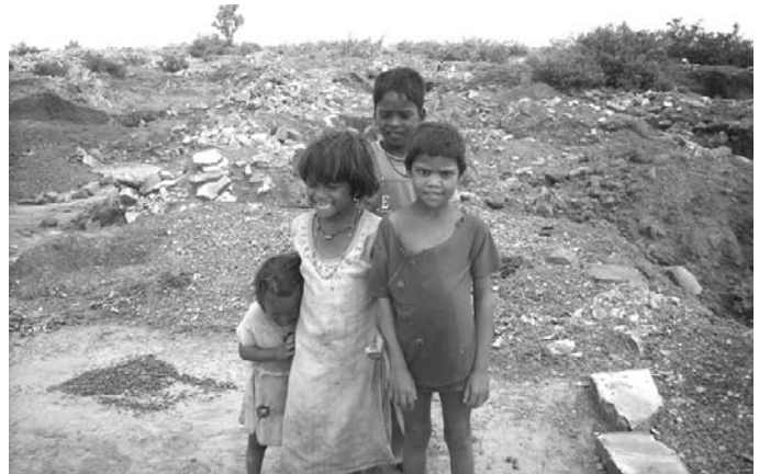
Malnourished and out-of-school, children of mine workers in Panna (Photo August 2009)

In Hardua village that is home to 30 Gond families, around 12 families participated in the group discussion we held regarding the diamond mining activities. None of these families have land and all of them are dependent either on mining, which takes place for 4–5 months in a year, and the rest of the year they either sell wood from the forest