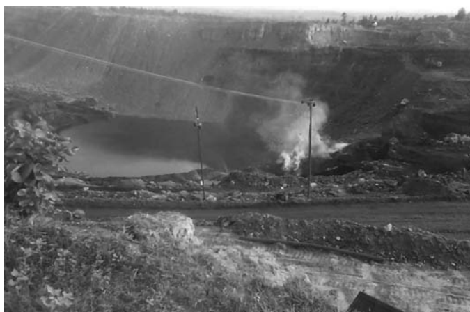
The burning coal from CCL mines, Hazaribagh (Photo September 2009)

In 2007-08, Jharkhand was the leading producer of coal and kyanite, and the second leading producer of gold in the country. The state accounts for about 35 per cent of rock phosphate, 29 per cent of coal, 28 per cent of iron ore, 16 per cent of copper ore and 10 per cent of silver ore resources of the country. In 2007-08, the value of mineral production in Jharkhand was Rs. 95.28 billion, an increase of 11.5 per cent from the previous year. In terms of value, over 90 per cent of the state's