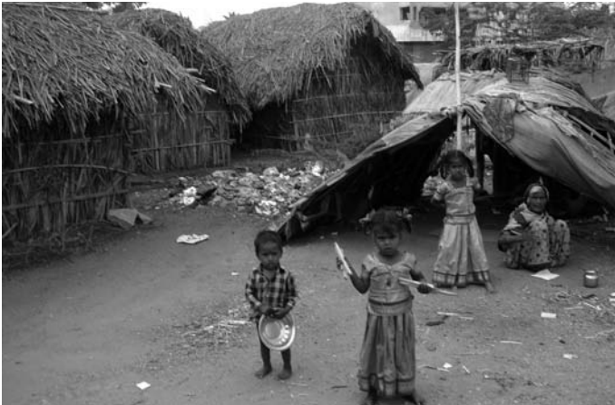
Children of mine workers in Hospet slum—many children work in garages, tea stalls, mine sites, as truck cleaners coolies, loaders, domestic labour (Photo January 2010)