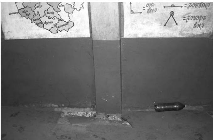
Classroom of Valmikinagar primary school damaged due to mine blasting operations near Kariganuru, Hospet, Karnataka (Photo January 2010)

The primary school in Valmikinagar, Kariganuru has 105 children enrolled. There are only three teachers for classes I to V and four classrooms of which one is damaged due to mine blasting activities happening nearby. According to the headmaster only 80–85 children attend school regularly but