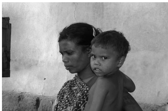
Malnourished mother with malnourished child-mining affected in Damanjodi (Photo January 2010)

The situation in terms of health is also a major concern in the state. Although life expectancy in the state is close to the national average (58.9 years), there are wide rural and urban disparities, with the rural life expectancy being 58.3 years, compared to 66 years in the urban areas. It is estimated that nearly half or 48 per cent of women in Orissa suffer from nutritional deficiency. The numbers are much higher in terms of illiterate women (54.6 per cent) and ST women (55.5 per cent). 230 Malaria is a serious problem in Orissa, with the state contributing to 23 per cent of malaria cases and 50 per cent of malarial deaths in the country. 231 The illness is particularly endemic amongst the ST population in districts such as Koraput located in the south of the state.