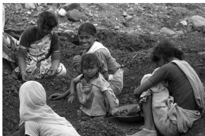
Migrant women and their small children working at an illegal mining site in Sandur (Photo January 2010)

Sandur is known for almost every inch of land being taken on lease by small contractors for iron ore mining. The local people from the mine site visited by us said that, in an area of 20–30 acres there were about 100 illegal mines. In each mine site 7–8 workers were found, mainly women and girls. According to the owner of a mine interviewed, thousands of small contractors sell their iron ore to Obulapuram mining company, which is just 5 km away, at a rate of Rs.4,000 per truck. We found small girls even of the age of 5 years working in these mine sites and when questioned, the mine owner had a straight reply, that as they supply ore to Obulapuram, they do not have to deal with the law or police as these are 'taken care' of by the company.