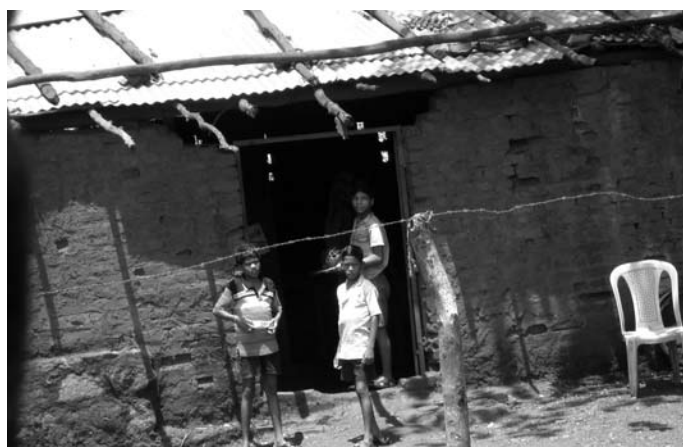
Children working at roadside dabha near Khasia mining site, Keonjhar (Photo July 2009)

In every village, as given in Table 2.33 not less than 50 children are involved in daily wage labour activities. Although there are gaps between number of school drop-outs and number of child labourers, this could be because it also includes children below 6 years of age and some of the children may be staying at home, and not working on a regular basis. Table 2.33 gives information on child labour and school drop-outs in villages visited in Keonjhar.