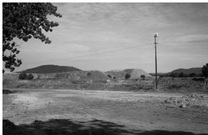
Coal mining area, Raigarh (Photo November 2009)

Chhattisgarh is one of the richest states in India in terms of mineral wealth, producing 28 major minerals. According to the Ministry of Mines the value of mineral production in Chhattisgarh increased by 17.5 per cent at Rs.105.1 billion in 2007-08 from the previous year. This has allowed the state