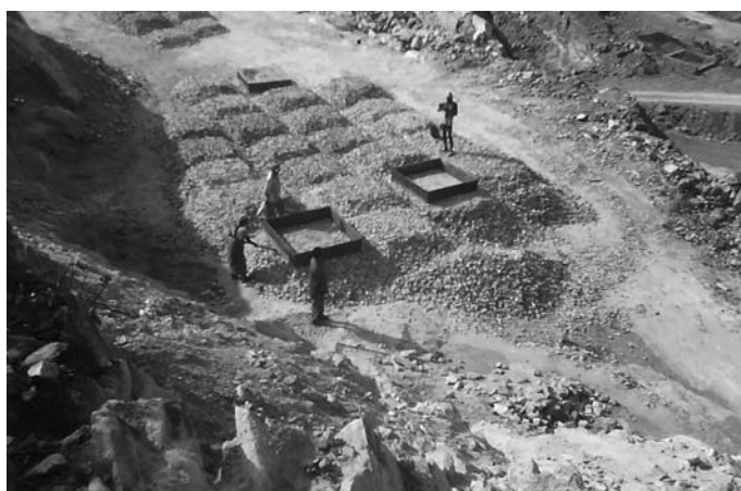
Dolomite mining of BSL, Sundergarh (Photo November 2009)

In spite of the existence of mining companies, migration of unskilled workers is high in Sundergarh, which speaks for the low employment opportunities that mining companies create for local people. This is also the reason why Sundergarh has become one of the junctions for trafficking and migration, especially with respect to young girls being whisked away by organised trade for human labour as well as for prostitution. 271