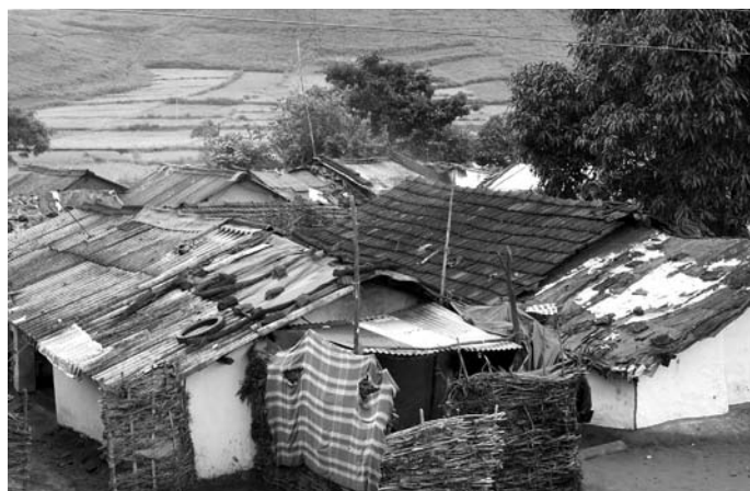
Displaced camp, Damanjodi (Photo June 2009)

Compensation for land was given only to farmers who had pattas (title deeds), so some of the adivasi and dalit families who did not possess pattas did not receive any compensation and also lost their livelihood. The PAPs also reported that most of the families are now working as landless labourers either in agriculture, animal rearing or as daily wage labourers