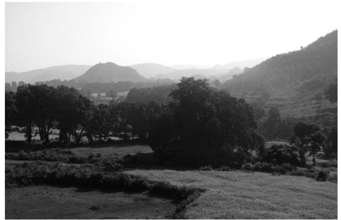
Forest and agricultural land threatened by mining in Kasipur (Photo October 2009)

Orissa is one of the largest producers of rice in India, growing almost 10 per cent of the total rice produced. The state also