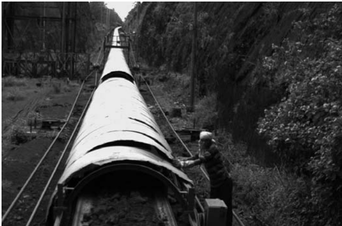
NALCO conveyor belt

In 2007-08, there were 227 reporting mines in the state. The total mine lease area covers 721,323 ha of land. This includes over 16,795 ha of forestland which has been officially diverted for mining. 252