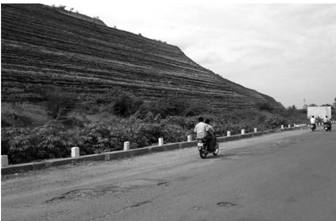
Cyanide heap in the middle of Kolar township—the controversial hill that is supposed to be causing radiation (Photo June 2009)

The mine tailings or the cyanide hill as it is popularly known is located in the center of the township. Ironically, while it