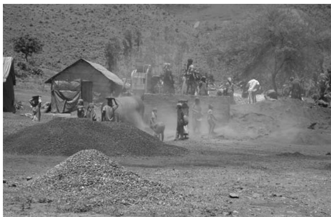
Iron ore mining in Hospet (Photo- June 2009)

is also the sole producer of felsite and the leading producer of iron ore, chromite and dunite. The state hosts 78 per cent of India's vanadium ore, 74 per cent of iron ore, 42 per cent of tungsten ore, 38 per cent of asbestos, 33 per cent of titaniferous magnetite and 30 per cent of limestone, as well as less significant proportions of a number of other minerals. 19