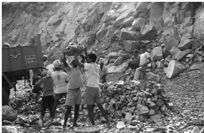
Youth help in loading activities at the quarry sites

Almost all the important minerals are produced in Andhra Pradesh. These include coal, limestone, barytes, dolomite, feldspar, iron ore, manganese ore, silica sand, ball clay, laterite and mica (crude). 300