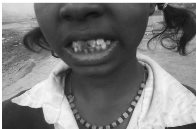
Children affected by fluorosis in Mudagaon village, Tamnar block (Photo November 2009)

Although within the company premises of the large companies there is child labour engaged, the definition of child labour has to be questioned here, because we were informed that many adolescent boys and girls between the age of 15 and 18 work in the peripheral activities related to mining like loading, road construction, as cleaners in trucks and other daily wage labour hired by the local contractors. Besides, very few from the local communities are engaged in mining related work and we were informed that a lot of migrant labour from Haryana, Uttar Pradesh, Jharkhand and Bihar are working in large numbers. The people reported that as migrant labour are less likely to protest or demand, the companies bring labour from outside.