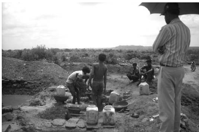
Children working in diamond mines under contractor's supervision (Photo August 2009)

Increasing amounts of land previously used for agriculture had now been converted for mining and quarrying activities. This is an extremely worrying situation, given that around 80 per cent of the state's population still live in rural areas and are dependent on agriculture for their livelihoods. Many of the communities interviewed across all the districts had previously relied upon agriculture or livestock grazing for their survival, but were now working as daily wage labourers in the mines due to lack of available land.