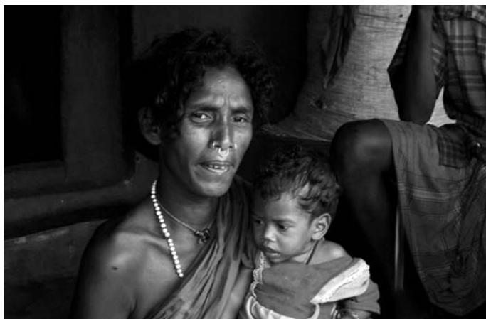
Single woman—vulnerable and destitute, Damanjodi (Photo June 2009)

Villagers have reported 10–15 cases of sexual harassment of the women from their community. Women walking to the mine sites for daily wage work have faced intimidation by migrant labour and truck drivers. 269 Some of the single women and widows who have no other source of livelihood have been forced into the sex trade in the fringes of Damanjodi and Mathalput. Also there were at least 100–200 HIV/AIDs affected persons but it is difficult to give accurate estimates. Damanjodi has acquired the reputation of being the second Ganjam (a city in Koraput district with high incidence of HIV/AIDS) in terms of HIV cases. Considerable number of migrant workers come from Ganjam and coastal belt. 270