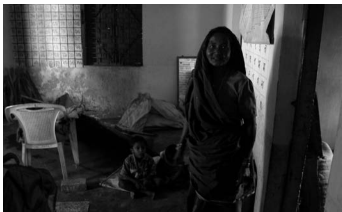
Anganwadi or godown? A sahayaka manages the anganwadi in Khamhariya village (Photo November 2009)

Source: DISE report card, September 2008