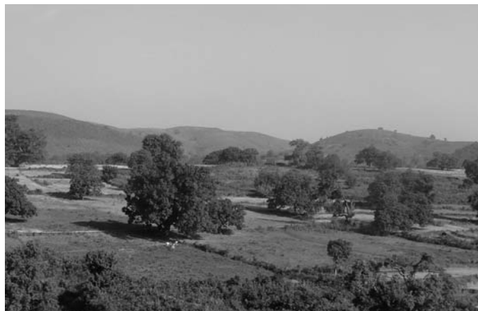
Rich agricultural land proposed for mining, Keonjhar (Photo June 2009)

Source: Interview carried out in Salarapentha, Keonjhar, February 2010