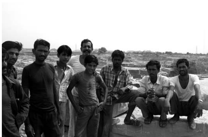
Meeting with stone quarry workers, including child labour at Kaliberi (Photo July 2009)

Several children between 12 and 15 years old were interviewed in the mines around Jodhpur district. Most said that they had been working there for a few months, since they had dropped out of school and earned between Rs. 30 and Rs. 50 a day, filling trucks and doing other similar heavy tasks. 116 Most adult mine workers interviewed said that children earned around Rs. 50–60 per day working in the mines. Several villages explained that only children from the very poor families are working; the others send their children to school. In one village, for example, residents estimated that around 90 per cent of the children in the village attend school; the remaining 10 per cent (around 250 children) were out of school. In this area of Jodhpur district, several children were spotted driving stone-filled trucks; none of these children looked more than 14 years old. None of the children either had any work safety gear that could protect them from the risks of accidents, injuries or even minor bruises. For the children, there is no choice and the risks are high especially during the initial years of work when they had not yet gained the expertise to handle the mining work. The workers reported that they were easily susceptible to eye injuries, mine-slips and mine collapse, breaking of limbs or their back due to falling, or from stones crashing over them.