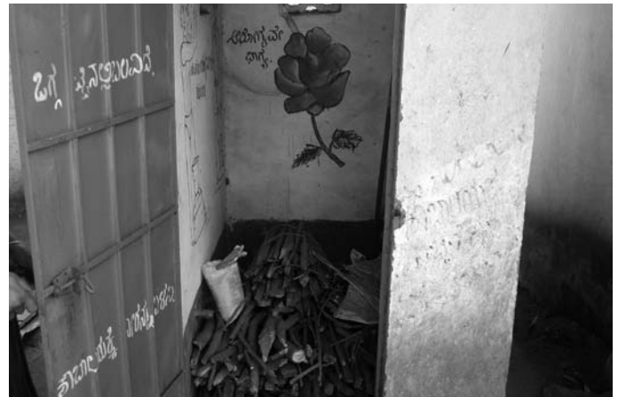
Toilet being used to keep firewood at Sultanpura anganwadi in Sandur (Photo December 2009)

The doctors at the CHC in Toranagallu, Sandur, gave their medical observations of the health problems in the taluk . They felt that the large number of steel plants set up in Sandur have created air pollution with toxic fumes from the chimneys causing allergies and infections to the people in the surrounding areas. Children particularly, are exposed to this from birth and are therefore, having respiratory illnesses. The CHC records here show 59 cases of TB and 51 cases of HIV/AIDs, most of whom were mine workers. The hospital