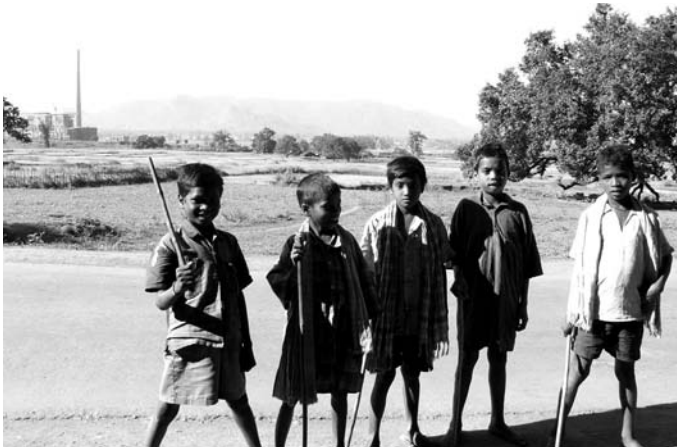
Child labour outside NALCO township

Child labour is a clear indication of the social and economic status of a community, coupled with the inaccessibility to basic education, the reduced livelihood opportunities and landlessness due to the mining project. All these factors have resulted in more children dropping out of school to supplement their family incomes. Also, the township's demand for domestic labour has increased the female girl child's absorption into menial labour as house-maids and domestic help. The youth who were interviewed stated that as they do not qualify for the matriculation examination due to their poor school education, and very few are able to reach college level education, they end up as cleaners and drivers of trucks, ply autos and buses for private contractors or are hired in petty shops and businesses.