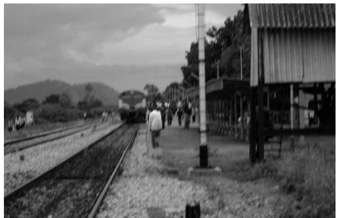
The morning train that leaves from Kolar carries thousands of young boys and girls to work in Bengaluru (photo June 2009)

This immediately shifted the responsibility of supporting the families on teenage children. However, as KGF offers no job opportunities, they have to travel out to the city of Bengaluru approximately 120 km away, in search of employment. The workers sardonically comment on the government's generosity to the BGML employees when they speak about the railway line and the trains that were introduced as compensation for the mine closure. Every morning between 7,000 to 12,000 youth and young adults leave for work to Bengaluru by these trains and return only late in the night. The study team saw packed crowds leaving at 6.00 am in the morning