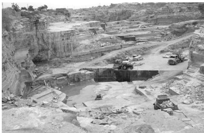
Stagnant water in mine pits, breeding mosquitoes, Kaliberi (Photo July 2009)

home, they are forced to return to work within 15–20 days after delivery. One pregnant woman interviewed complained of intense pain in her chest. Besides, the distance to the PHC being too far, the women cannot afford to give their time and money to travelling to the PHC for any treatment.