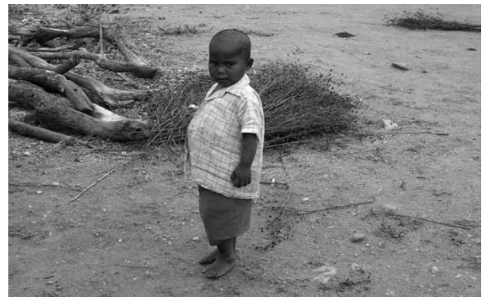
Malnourished child in a mining affected colony (Photo December 2009)

Kariganuru village has 7–8 private clinics which reflect the high rate of illnesses here. Although there was a government TB hospital, it is closed now. The common diseases found in