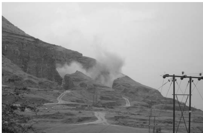
Blasting in stone quarry areas at Nashik....unsafe for surrounding villages and mine workers' colonies (Photo September 2009)

In Suyog Nagar anganwadi , records show that, of the 211 children enrolled, 123 children are malnourished, mostly under Grade I. In most of the mining colonies, there are no anganwadis , neither are there any crèches at the mine site. So infants are taken to the work place, thereby exposing them to the dust, pollution and risk of accidents, as the parents cannot keep a watch over the children continuously. Table 2.05 gives the Bal Shikshan Kendras run by Santulan in the absence of anganwadi centres in the mine workers' colonies between 1997 and 2007. This is a very small sample of children below 6 years of age who are not covered under the Integrated Child Development Services (ICDS) programme which is the basic support institution for nutrition and protection of children. At a state level, there could be a much larger section of this child population who do not have anganwadis and therefore, parents are forced to take them to the mine site with no safety or nutrition available for these infants.