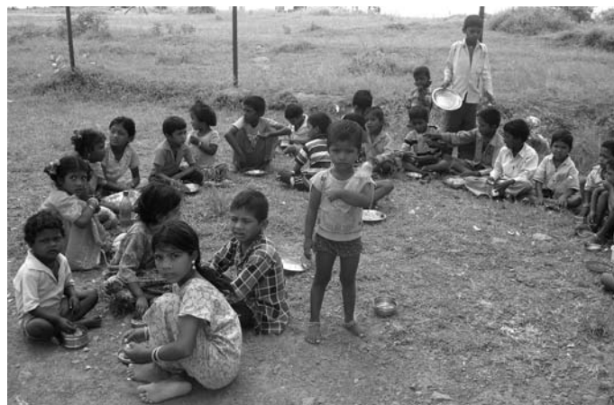
Children of Balshikshan Kendra —in the absence of anganwadis , NGO provides mid-day meal (Photo September 2009)