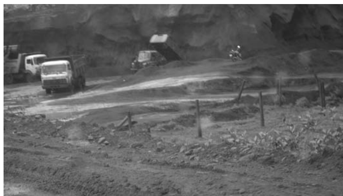
Iron ore being loaded in Badakalamati area, Keonjhar (Photo July 2009)

It was very evident that there was serious air and water pollution in the entire belt of Joda and Barbil. Environmental degradation is perceptible through the reduced forest cover as forests have been cut down, both legally and illegally, for the purpose of mining. In a day, atleast 60,000 trucks run through