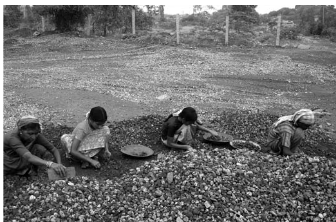
Young girls are engaged in sorting and breaking of iron ore, working 8 hours a day, at Kariganuru, Hospet (Photo December 2009)

number of children working in the mines and in other non-mining activities. Many of the children are from migrant families. Some of the migrant families have settled down in the slums in Hospet while many migrate only seasonally for mine labour. Children are engaged in breaking of stones, digging, dumping and also in cleaning of trucks. Many, as they live on the site and accompany their parents, start working even at the age of five and six and are adept at their work by the age of 10. Boys from the age of 12 start taking on the more difficult work of breaking the larger boulders and stones while the girls are engaged in breaking these into small stones, powdering them into iron ore filings and in loading activities. The average earning of the children working in mining activities ranges between Rs.80 and Rs.100 per day.