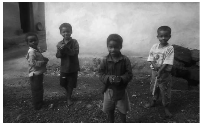
Children play with coal in mining affected community in Urimari Project area, Hazaribagh (Photo September 2009)

In Urimari, 14 villages with 95 per cent adivasi population were displaced by CCL and apart from monetary compensation the villagers reported that they did not receive any other benefits from the company. The young girls working in the mine sites complained that although they were opposed to the expansion of the coal mines, their villages are like islands around mine pits and the mining companies are eating into their village lands till they have no choice but to allow land acquisition.