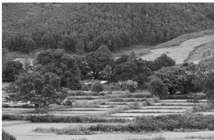
Pre-mining area, Kasipur (Photo June 2009)

Kasipur area is mainly inhabited by adivasis living in the midst of thick forests and hills. These areas are, in legal terminology, called the Scheduled Areas as per the Fifth Schedule of the Indian Constitution where majority adivasis live and have exclusive ownership of land. Out of the total population of the district nearly 72.03 per cent of the people are BPL families 272 and more than 50 per cent of its total population belong to adivasi communities. Kasipur consists of 20 gram panchayats which is a conglomeration of around 270 villages. According to Census 2001, the total population of the block is 67,254. The Jhodia, Kandho, Paraja tribes and the Panos (untouchables or dalits ) constitute around 70–80 per cent of the total population of the block and the rest are OBCs. The adivasis here mainly subsist on agriculture and collection of forest produce.