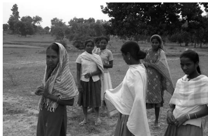
Young girls working in Dolomite mines and stone crushers at Birmiritrapur, Sundergarh (Photo November 2009)

Children from displaced families and mine workers' families were found to be working either in mining or other ancillary