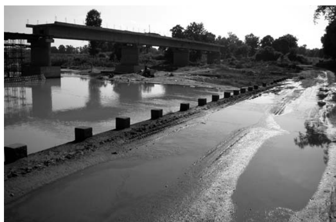
Kelo river in Gare village, life source of an entire region polluted by coal dust (Photo November 2009)

The people in all the villages covered under the study, universally declared that the water of Kelo river cannot be used either for drinking or even for bathing. In the last 3 years, the people have observed how the Kelo river has almost turned black with coal dumping. The people complained that the livestock is also seriously affected due to the water contamination. Besides the depletion of water due to borewells dug up by the