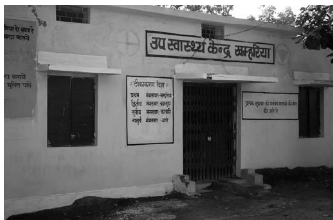
Closed PHC Sub center, Khamhariya (Photo November 2009)

In every village people complained that children suffered from illnesses due to water contamination. Some of the villages like Milupara are close to the mine sites and hence suffer from both water and air pollution. The most common illnesses reported among the children were malaria, diarrhoea, hydrocele, pneumonia, skin ailments, bronchitis, gastroenteritis, abdominal pains, arthritis, jaundice and other respiratory ailments. Hydrocele is reported to have increased in the last 5 years. The villagers observed that water contamination is affecting reproductive health as children are observed to be