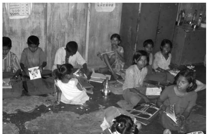
But for these Pashan Shala run by Santulan, children would end up in the mine sites breaking stones (Photo September 2009)

In Sai Stone Quarry (Magoan, Nasik), 60–70 girls out of the 150, are working in the stone crushers, breaking stones and loading. At Mahalaxmi Stone Quarry five children, around 13 years of age, were found to be working and in a nearby quarry, eight children, aged about 10 years, were working at the mine site. The children, who said they were migrants from Bihar, reported that they work in two shifts where four children work in the morning and four in the evening shift. In Matere Stone Quarry, seven children between the ages of 14 and 16 were found working. The women regretted not being able to send their children to the Santulan Pashan Shalas as their economic situation was really desperate. Moshi Stone