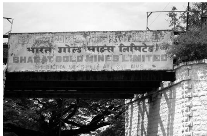
Closed BGML (Photo June 2009)

Based in Kolar district of Karnataka, BGML was a Government of India public sector undertaking, spread over an area of 13,000 acres. Established by the British in 1905, it became BGML in 1972 under the Government of India, Ministry of Mines, and was primarily engaged in the extraction of gold till the year 2002 when it faced a sudden closure on grounds of financial losses. The company extracted 514.17 kg gold in 1997, and in 1998 the revised target was 550 kg of gold but actually only 404.1 kg could be extracted; between January and March of 1999 145 kg was extracted by the company. At the time of closure the company had on its payrolls, a total of 4,345 employees of whom 2,336 were technical and 2,009 were non-technical staff. 27