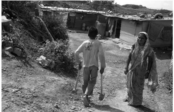
Mother awaits child returning home after a hard day's labour in the mines—each hammer weighs more than 10 kgs (Photo September 2009)

In the nine sites visited, children are attending school only where Santulan, the NGO, runs the Pashan Shalas . The Pashan Shalas were created to rescue the children from working in the mines and currently there are 2001 children enrolled in these schools, scattered across five districts in Maharashtra. But for this intervention, all these 2001 children would have been working in the quarries or helping their parents in petty chores at the mine sites. At Gore Wasti Pashan Shala , the children shared information about their teenage brothers and sisters working in the mines and how most of them had joined work as children. For Santulan, it is difficult to motivate children and adolescents who are already