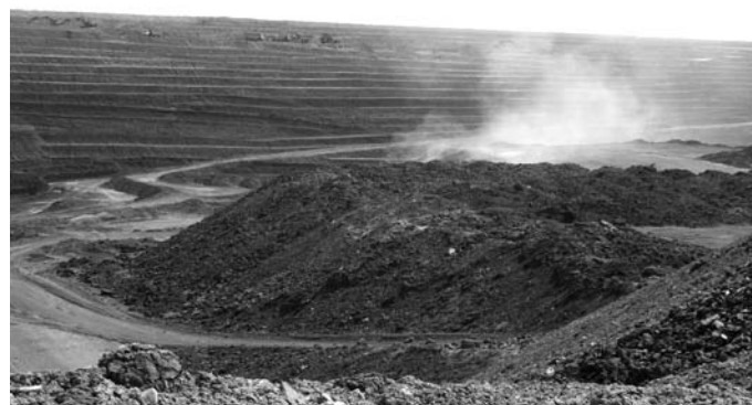
Lignite mining in Barmer district (Photo July 2009)

Rajasthan produces 10 per cent of the world's and 70 per cent of India's, output of sandstone. 86 Given that most of the mining and quarrying in Rajasthan is carried out on small, informal sites, and that illegal mining is reportedly rampant, it is difficult to estimate the actual size of the workforce in the state. According to the Census, there were 233,130 people (main and marginal workers) employed in mining