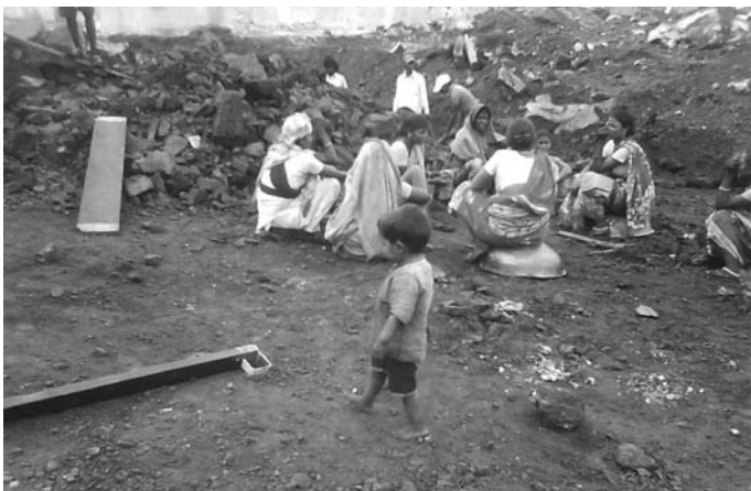
No anganwadi for this child— the mine site is his playground (Photo September 2009)

The water shortage as well as the contamination has been creating an unhygienic atmosphere for the children. They cannot afford to bathe regularly nor can they wear washed clothes. Because of this, children in this area were found