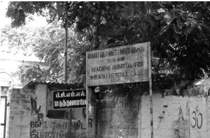
Closed BGML Hospital in Kolar township which provided free medical services for workers and their families (Photo June 2009)

requirements of the township as well as the general public of the taluka as it is highly understaffed. The Medical Officer reported that the workers mainly suffer from respiratory illnesses, chronic bronchitis, asthma, tuberculosis (TB) and silicosis although the latter is not an officially confirmed diagnosis as most silicosis patients, to the convenience of the state and the industry, are diagnosed with tuberculosis. The health problems of the children, as reported by the Medical Officer relate to respiratory illnesses, skin diseases, bronchitis and malaria. The Medical Officer also stated that there were cases of HIV/AIDS and Sexually Transmitted Diseases (STD) but it was hard to state whether they were from the township or outside as the workers do not have a separate hospital now. The workers' families are unable to meet the medical expenses, so some of the workers' unions are voluntarily helping the families in accessing medical facilities. Therefore the burden of supporting the families has fallen on the youth again.