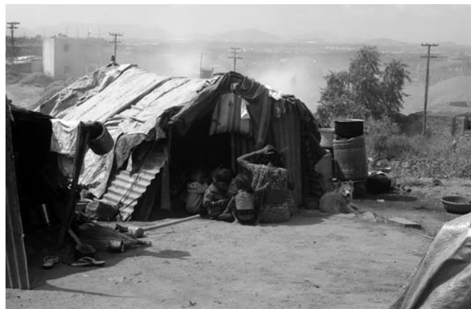
Migrant stone quarry workers' 'houses' surrounded by dust from the quarries (Photo September 2009)

The nine stone quarries visited showed India's disrespect both to the Constitutional provisions under Article 21 of Right to Life and to the international agreements. It showed how poor and unstable the living conditions of the workers were. If we found any amenities for workers, it was due to the efforts made by Santulan, in getting the workers into assertive collectives. Most of the mine workers' colonies were located away from the main villages, and they were not part of the village community, but settled wherever mine owners allowed them to temporarily set up shacks, close to the mines. In some places, vacant lands were temporarily given to the workers by the local panchayat , based on the negotiations between the mine owners and the panchayat leaders. Hence, the workers were at the mercy of the village leaders.