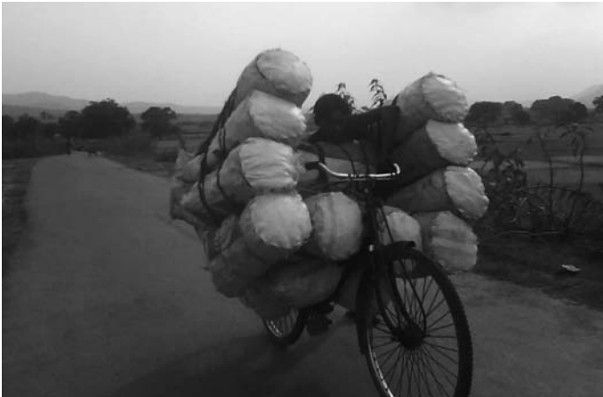
The 'coal boys' – young boys enrolled in school, but out all the time Hazaribagh (Photo September 2009)

The workers reported that the company provides 10 trucks per day for the local people as a source of livelihood for which they get Rs.1,200–1,300 per truck for loading 12 tonnes of coal. This is shared among all the members of the group. On an average, the workers load 18–20 tonnes per truck and get an additional wage of Rs.100 for every tonne. However, their income is entirely dependent on the availability of coal, which is erratic and hence the workers do not earn any money on some days.