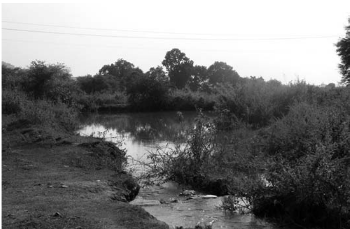
Water crisis! Water contains mine tailings and is unfit for human or animal consumption, Sundergarh (Photo November 2009)

The area has been witnessing serious health problems related to waterborne diseases due to the contamination of water. Problems like filaria, hydrocele and gynaecological problems were reported by the local leaders as well as by the women interviewed. Serious occupational health hazards were reported around the cement factories in Rajgangpur. In the summer months and for many parts of the year, severe water shortage is experienced due to low groundwater levels. It is mainly the girl children who accompany their mothers for collection of water, which is contaminated. They are constantly