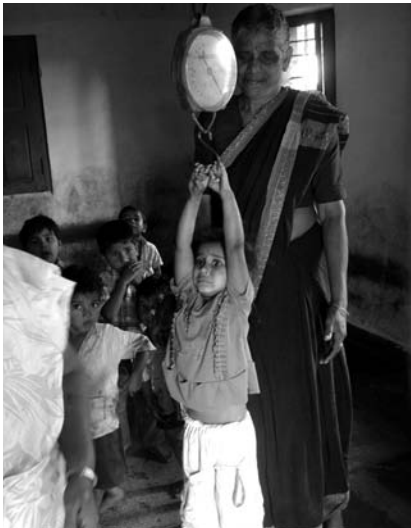
Child hanging to the weighing scale, which was lying rusted, at Sultanpura anganwadi . No record of children's growth maintained (Photo December 2009)

The anganwadi in Sultanpura showed 66 children enrolled although there are 85 children below 6 years of age in the village. On the day of our visit there were only 17 children present and the teacher hastily came to the anganwadi , upon hearing that a team was visiting. There were no records maintained by the teacher here and she could only show empty files. There