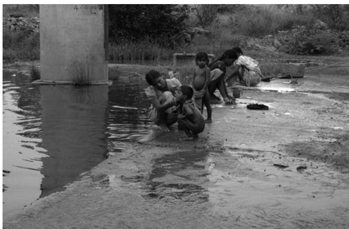
Contaminated water having iron ore waste, the only sources of water for bathing, washing and drinking, Sandur (Photo December 2009)

The dust pollution and depletion of groundwater forced many small farmers to sell their land to mining contractors as agriculture was made unviable. This has badly affected their food security and livelihood because of which children are directly affected in their health and nutrition. Many farmers themselves have been forced into mine labour with their entire families. This has affected the education of children and school drop-out is visible among local children whose villages surround the mining activities. Even if they do not work in the mining activities, the severe dust pollution and contaminated water have affected the general health of children. The doctors and chemist stores that we interacted with in Hospet, stated that chronic respiratory illnesses, allergies, lung diseases, diarrhoea and asthma have increased among children not only of mine workers but of the general public.