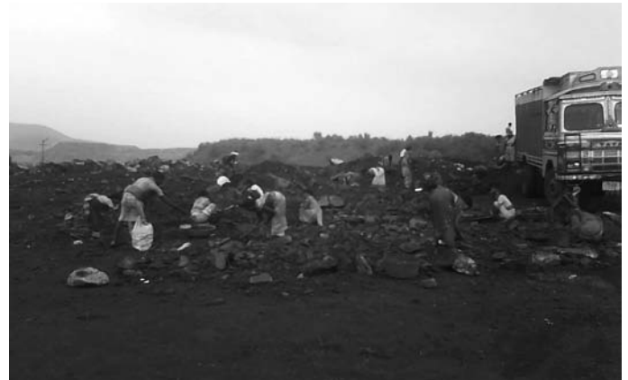
Displaced women, with children at their side, scavenging for coal, the only source of livelihood today, Hazaribagh (Photo September 2009)

In Potanga village, the discussion with the anganwadi worker revealed the terrible health condition of the children. Of the 40 children who are enrolled in the centre (which still does not have any infrastructure and activities are conducted under a tree), five are absolutely (grade IV) malnourished, and 15 come under the Grade II and III categories of malnourishment. Of the seven births recorded in the current year, only two have been institutional deliveries.