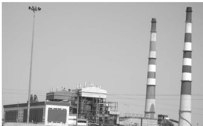
Thermal Power Project in Thumbli village (Photo July 2009)

There were also problems in terms of delayed payments for