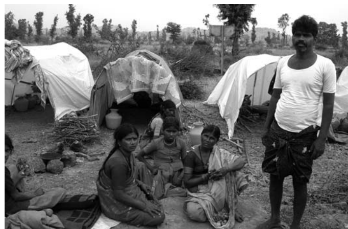
Migrant workers live in small plastic tents no larger than 3-5 sq ft in size, at the mine site, Sandur. (Photo December 2009)

The companies are mainly private operators with a few public sector companies like the National Mineral Development Corporation (NMDC). However, there are more illegal mines than legal ones operating in the district. The mining boom led to a scramble for mining with small contractors and even farmers themselves converting vast areas of agricultural lands into mine pits in a very erratic, uncontrolled and indiscriminate manner.