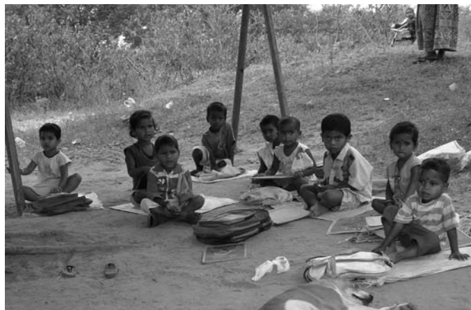
No infrastructure for this anganwadi . Children and animals attending the anganwadi under the trees, Brahmanimara, Sundergarh (Photo November 2009)

of the municipality. In Birmitrapur there are 15 government schools, one college and three high schools. The dakua group (women's SHG) of Birmitrapur which met the team at the anganwadi centre, stated that at least 20–25 children from each ward do not go to school and that every year at least 30 per cent of school-going children drop out of school.