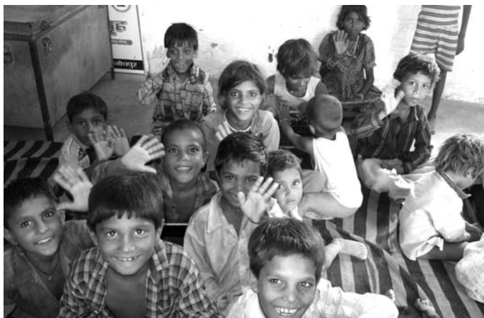
Children at MLPC day care centre (Photo July 2009)

Child health outcomes in Rajasthan are also poor. Around 80 per cent of children between six and 35 months are anaemic and 44 per cent of children under 3 years of age are underweight.