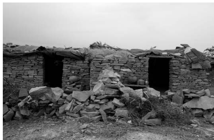
Houses of stone quarry workers in Jodhpur. (Photo July 2009)

Residents of an ST village in Jodhpur district, Bhat Basti, located close to Kaliberi mining area, explained how they used to be nomadic, but because of the increase in population in Rajasthan and less land availability, they could no longer find land for livestock grazing. As a result 20 years ago they were forced to sell their animals and move to this site, close to the mines in the hope of finding work. 94 There