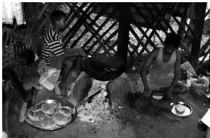
Child labour in Kasipur Area (Photo June 2009)

The anganwadi worker in Tikri stated that the number of child labour is rapidly increasing in the area. At present, around 30 per cent of the children in the age group of 10–15 years are directly or indirectly involved in the mining activities. In the nearest town of the mining project, it can be estimated that at least 500 children are working in the hotels, shops, garages, railway station and tea stalls. 275 From each of the villages affected by the UAIL project, there are an average of 50–60 children and adolescents under 18 years of age, working in the construction site of mining under local contractors. At present (just before closure of the mining activities) there were 400–500 children and youth of both sexes working in the mine site as daily labour.