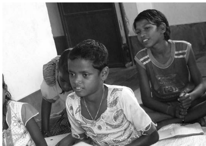
NCLP school, Birmitrapur, Sundergarh (Photo November 2009)

According to the Department of Mines, Orissa, Sundergarh district has a total of 87 working mines of which dolomite and limestone are 19 and dolomite alone is four. There are 268 applications for mining leases still pending with the department. There are also 49 sponge iron factories in the district. Each factory has 15–20 deep bore-wells whose depth is at least 800 ft from the ground level. Some of the sponge iron plants and mines had to be closed down due to non-compliance with pollution norms. It is a known fact, as expressed by the ex-Chairman of Birmitrapur Mr. Kishore Kujur, that there are as many illegal mines as legal mines in the region. The government is now inviting multinational corporations to establish large-scale industries of cement in Sundergarh.