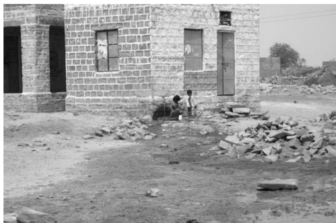
In crisis ridden Jaisalmer, poor water management and seepage (Photo July 2009)

Other villages reported that they were forced to spend a significant percentage of their meagre earnings from mining on water for their basic needs. In Bhat Basti village, there is no water supply so they have to pay for tankers. One tank of water contains 3,000 litres and costs Rs. 400. A woman interviewed in Bhat Basti explained how water was so scarce in their village, that she was unable to bathe her children.