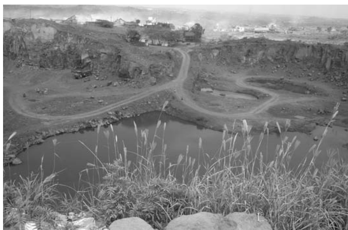
Open cast stone quarries without any protection wall (Photo September 2009)

Apart from the economic reason, children do not have education facilities as the colonies of the mine workers are far from the local village. So the school is too far from their homes, for the children. Parents also expressed their fears about the heavy traffic of tractors carrying loads and said that it was not safe for children to walk on these roads. As the parents leave for work in the early hours of the day and only return late in the evening, the older children have the responsibility of their siblings at the house as well as at the mine site, to watch over them for any blasting or hazardous activities in the surroundings. Besides, the children in the age group of 10–13 have to do most of the household chores, and they are always late for school or have to take their siblings along with them. At noon time, many of the children have to take food for their parents to the mine site.