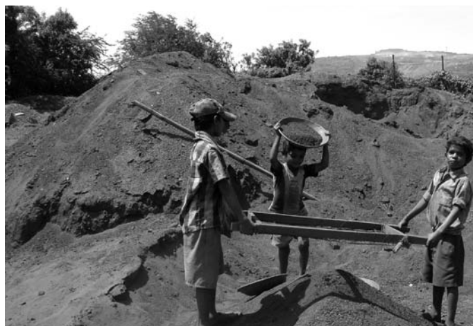
Children of migrant families work at crushing site, This one is in a crushing unit at Hospet (Photo June 2009)

It is difficult to give an exact figure for child labour, but one has to only visit Hospet and spend a whole day walking through the mines, and it is obvious that there are a large