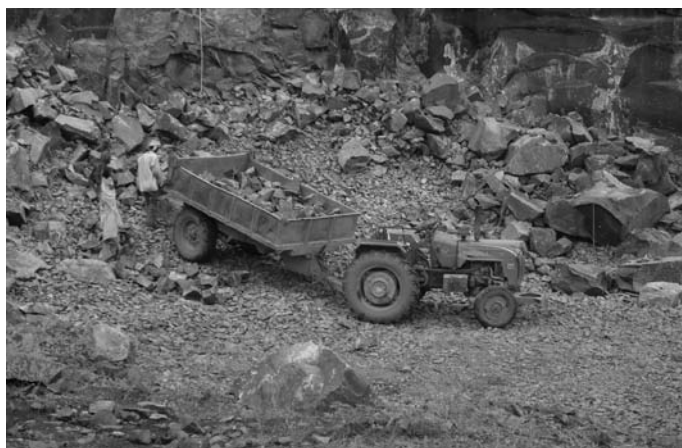
Unsafe working conditions at stone quarries (Photo September 2009)

workers (down from 35,900 in 2004). 48 The 2001 Census indicated that there were a total of 168,112 main and marginal workers in the mining and quarrying sector. 49