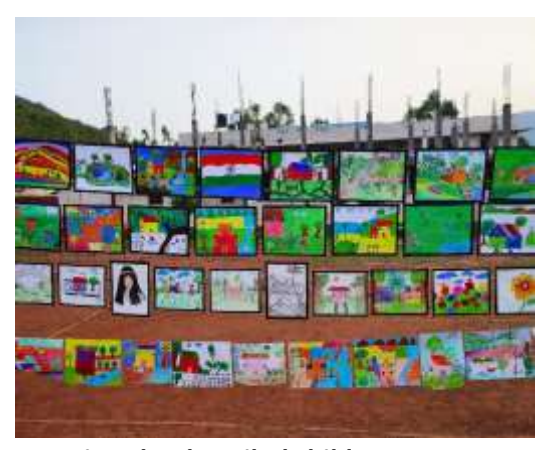
Drawings by the tribal children