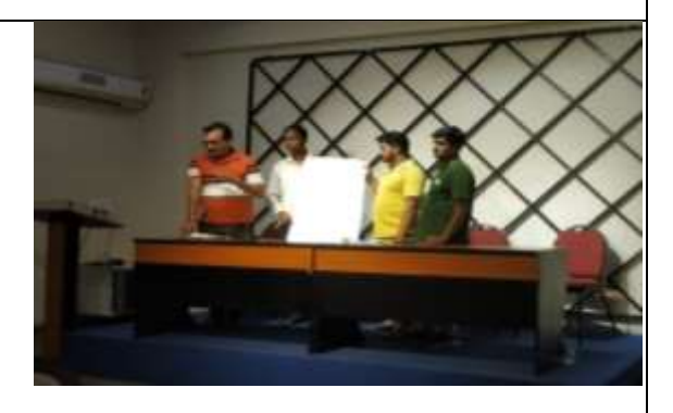
Group Presentations from various states