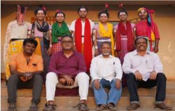
"Pratyusha"-Tribal girls home children