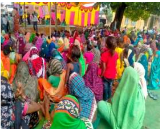
Coal Satyagrah, Community gathering, Tamnar, Raigarh