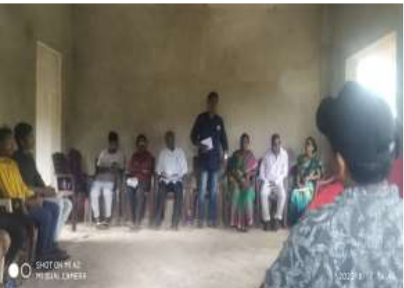
Meeting with local sarpanch and communities