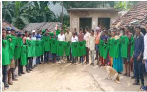
Village level meeting at Katiki village, Borra Sarpanch inaugurated T-Shirts with KWDC team