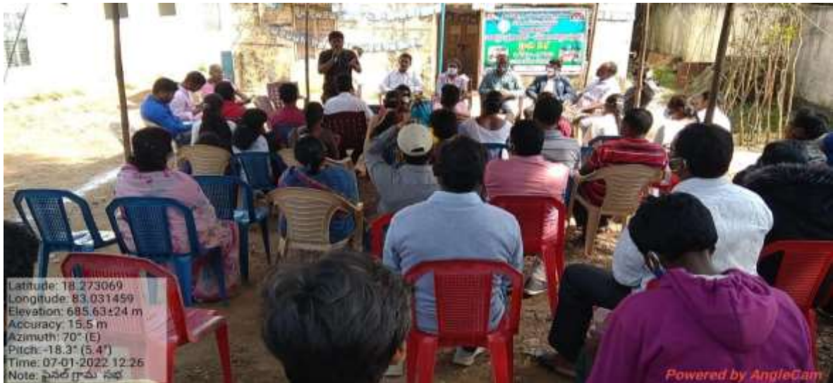
7th January 2022: Samata Team attended Gram Sabha at Borra Panchayat and explained Samata Judgment