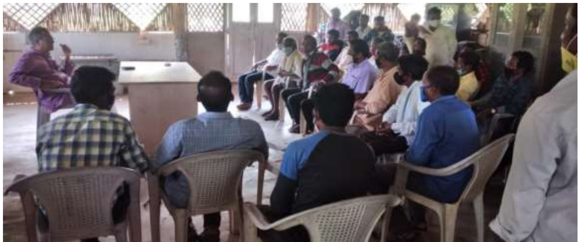
25th September 2021: Executive Director, Samata facilitating the community regarding the local resource and importance of Gram Sabha