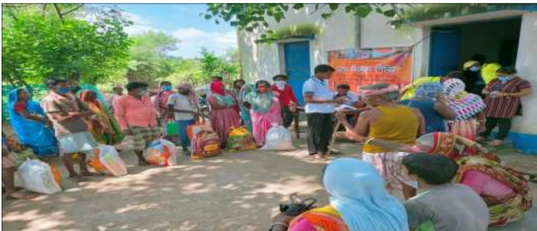
1st september 2021: Covid-19 Relief dry ration distribution at Birbhum District, West Bengal