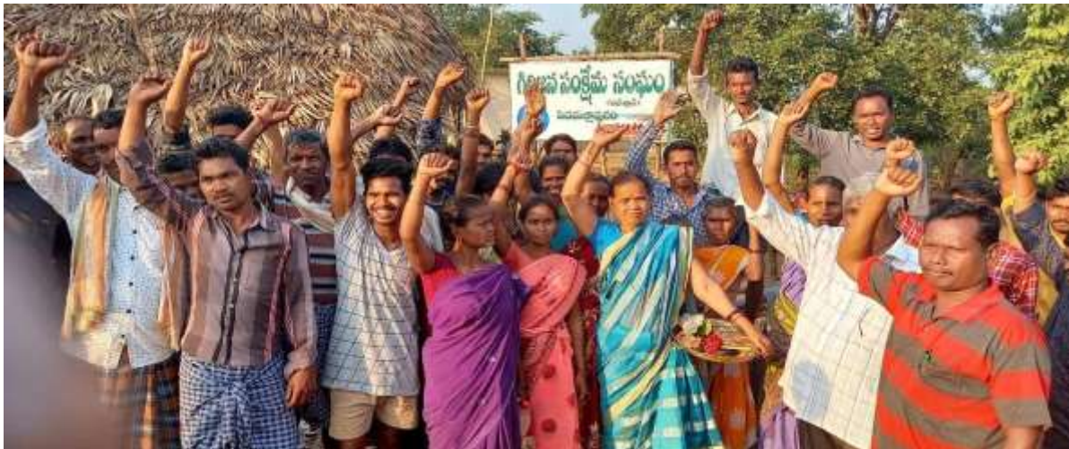
April 2022, the Tribal community demanded to include Pedamallapuram, Sankavaram Mandal, of East Godavari District in the Vth Scheduled area.

On 18th November 2021, International Children's day was organized and celebrated in MPP tribal school in Sargudu village of Nathavaram Mandal of Visakhapatnam dist and Tribal Welfare Ashram School in Daddugula, Nathavaram Mandal in ESR dist. of Andhra Pradesh