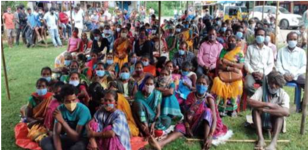
Borra Panchayat Community during the distribution of dry ration kits by Samata