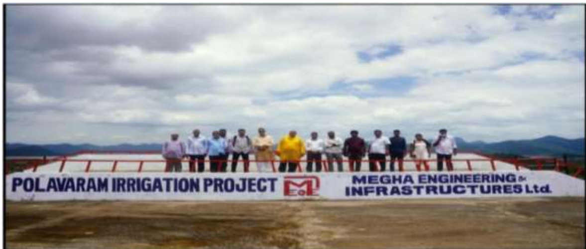
30th November 2021: Field visit to Polavaram Dam, East Godavari, A.P.

Furthermore, we also visited the Polavaram Dam construction site and R&R colonies on the 29th and 30th of November, 2021 to extend solidarity and technical support to the communities.