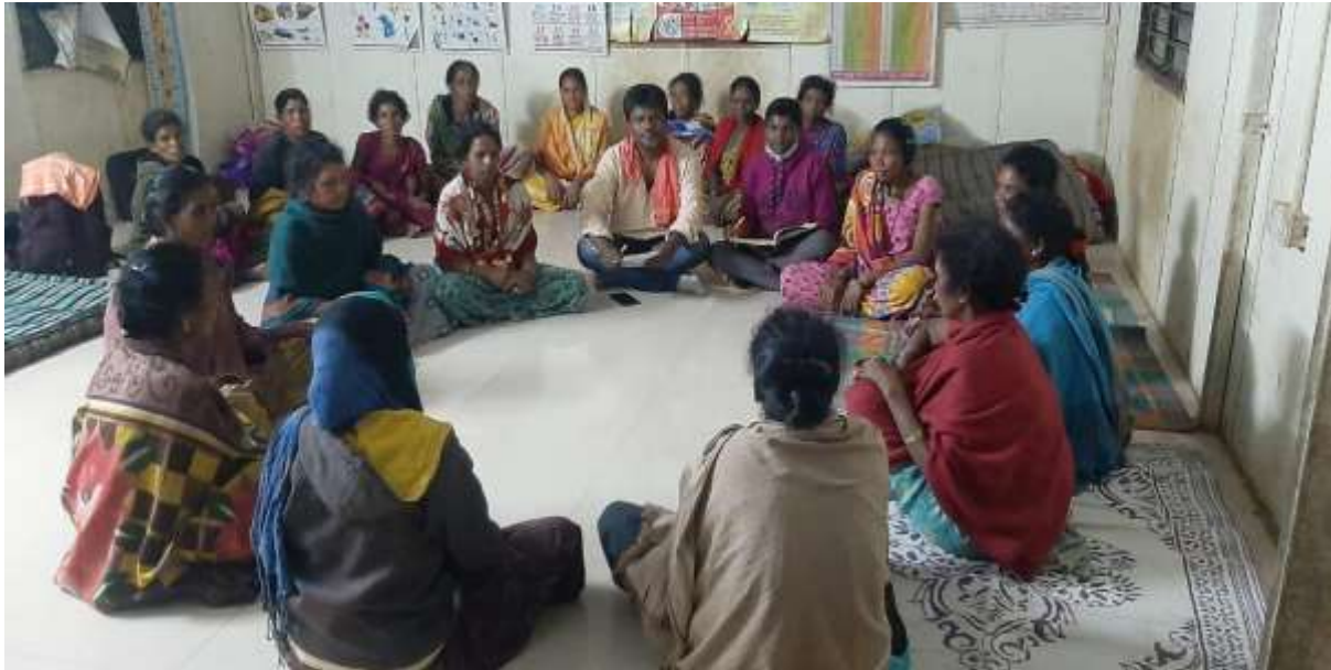
8th March 2022: on the eve of International women's day, a meeting was conducted with the Self Help Group at Katiki village, Borra Panchayat, Ananthagiri Mandal, Visakhapatnam