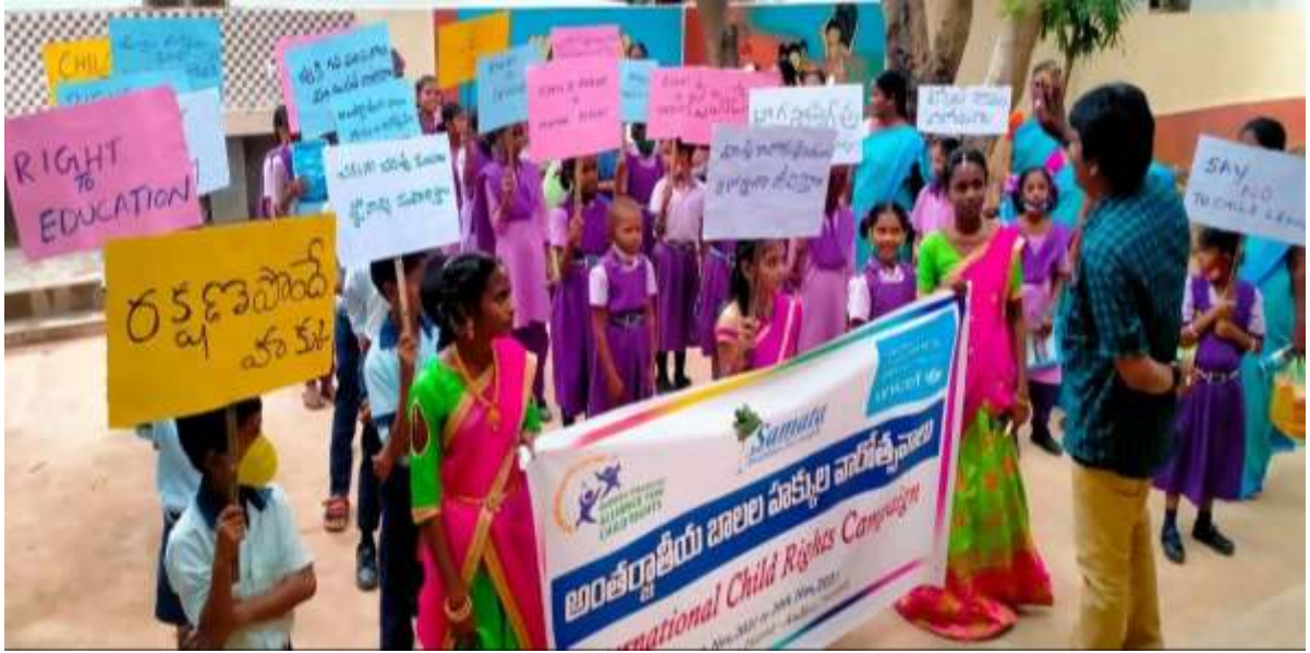
18th November 2021: International Child Rights Day at MPP School, Sarugudu, Nathavaram mandal, Visakhapatnam

On 26th November 2021, the constitution day was organized by our fellow and celebrated with students and teachers in Government Zilla Parishad School in Visakhapatnam in Andhra Pradesh.