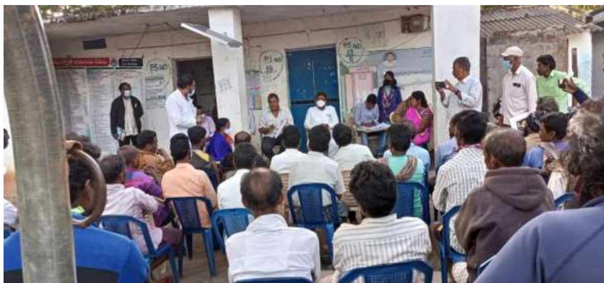
20th January 2022: PESA meeting at Valasi panchayat regarding mining

A meeting was organized on the issue of PESA on 20th January 2022 at Valasi Panchayat regarding the mining issues in their areas. A detailed discussion on mining and its impact was discussed and explained to the communities by the Samata Team