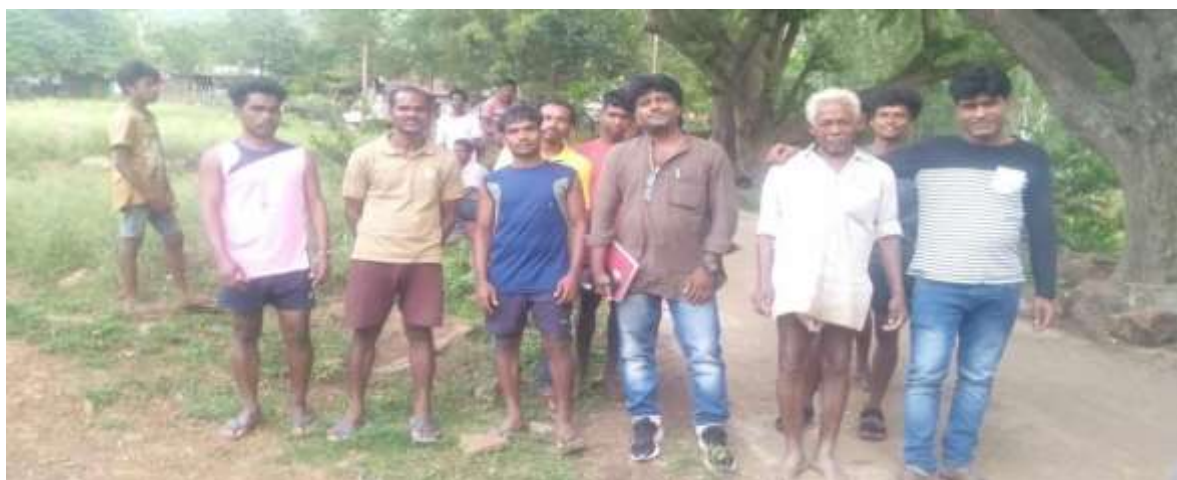
20th November 2021: Field visit to Nimalapadu