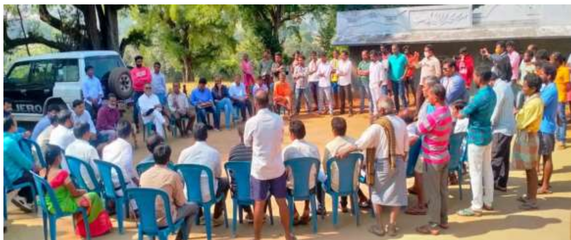
28th December 2021: meeting with APMDC at Nimmalapadu, regarding Community rights