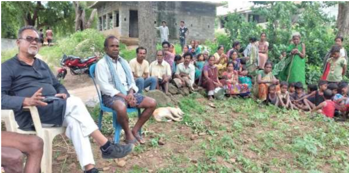
28th July 2021: Executive Director, Samata with Community at Nimalapadu, Visakhapatnam

Acknowledging the low rate of awareness of various government programs among communities, Samata initiated facilitating the gram sabhas at the village level in negotiating the livelihood, sustenance, and income generation from the ongoing tourism or mining initiatives for the communities in scheduled areas. For instance, Nimalapadu calcite mining issues where Samata is helping communities to claim their rights over natural resources as per the law of the land and Samata Judgment.