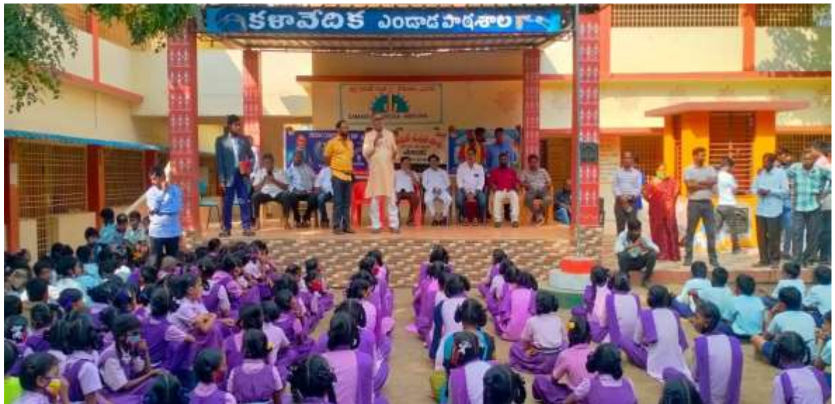
26th November 2021: Celebration of Constitutional day at ZP High School, Yandada, Visakhapatnam

On 26th November 2021, the constitution day was organized by our fellow and celebrated with students and teachers in Government Zilla Parishad School in Visakhapatnam in Andhra Pradesh.